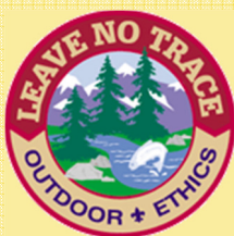
Photo of the Month

Directions: Follow I-75 south to Exit 135 (Perry). Head southwest on GA-224 to Montezuma, approx 20 miles. Just outside Montezuma, turn right on GA-26 and follow to the intersection of GA-49. Turn left on GA-49 and head south approximately 6 miles to Andersonville.